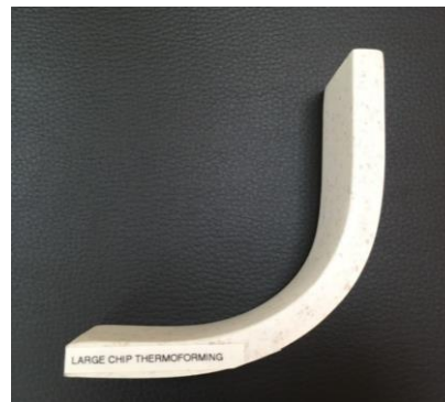
Large Chip Color