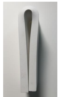
033T Flexy White