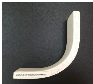
Large Chip Color